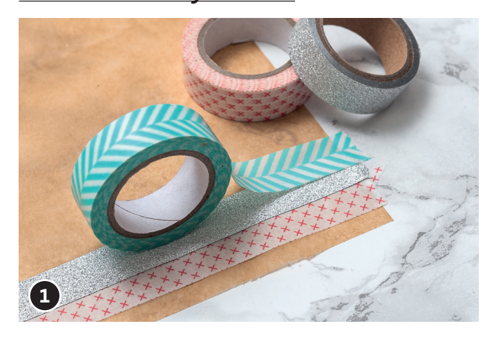
Glue 3 strips of tape slightly overlapping on baking paper.