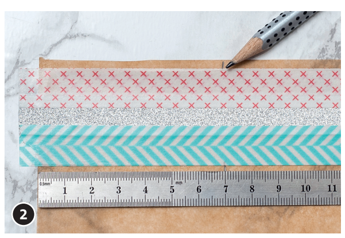
With the pencil draw a mark for cutting every 7 cm.