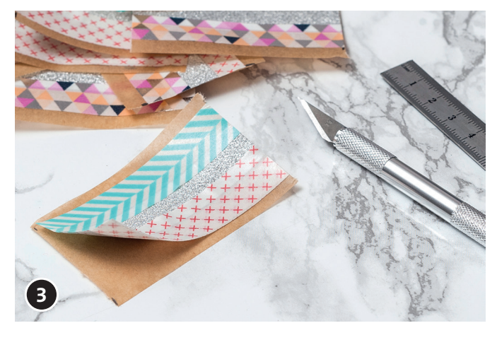
Adjust the ruler to the mark and cut the stripes with the cutter