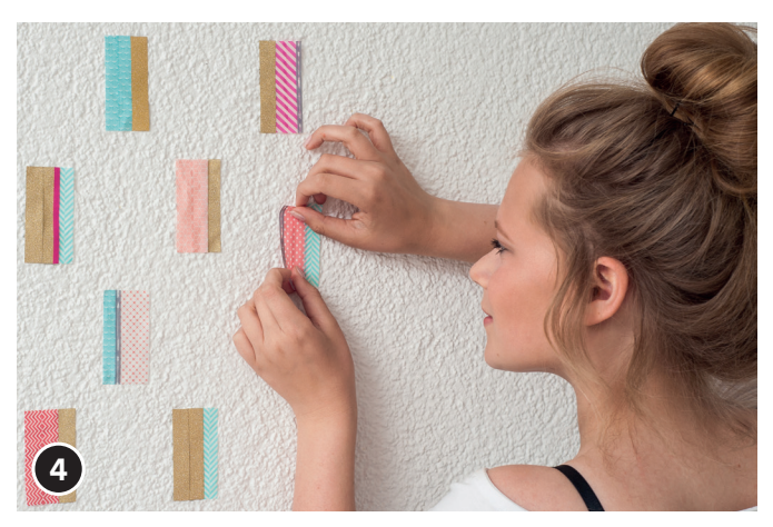
Separate the stripes carefully from the baking paper and wham! on the wall.

Have fun creating and enjoy! Your Opitec Creative Team!