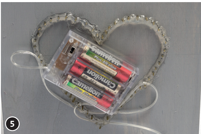
5 Glue the battery box on the house with the hot glue gun and coat the nails with hot glue.