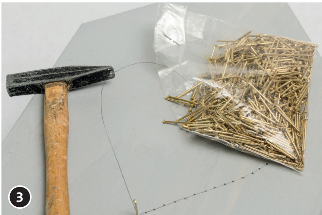
3 Knock in 4 nails.