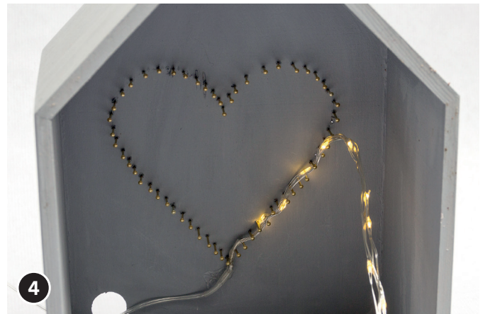
4 Thread the light chain. Wrap the heart.