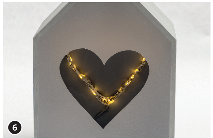
6 Cut the transparent paper and affix it.