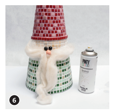
To weatherproof the beard, you can use clear varnish spraying several times.

Have fun creating and enjoy! Your OPITEC Creative Team!