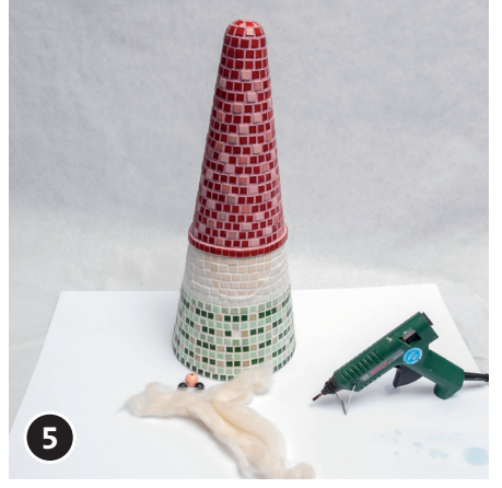
After drying and polishing of the mosaic surface start decorating. Paint wooden balls for eyes and nose with acrylic paint (large goblin: eyes 15 mm, nose 20 mm balls / small goblin: eyes 10 mm, nose 15 mm balls). Allow paint to dry. Take the glue gun (or crafting glue) to fix eyes, nose and wool beard.