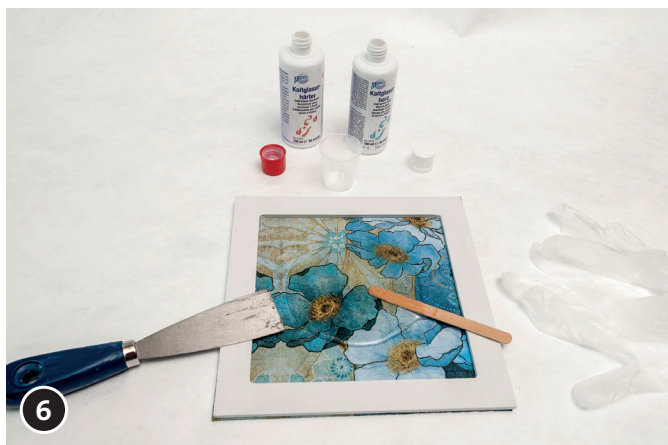
6 Mix the cold glaze according to product description.