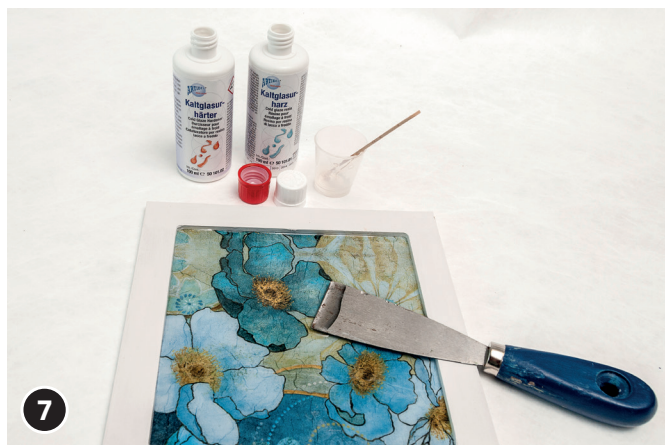
7 Let the glaze run over the serviette motif into the coaster depression within the frame. IMPORTANT! The cold glaze layer should not be too thick for grouting later without problems. Spread the glaze layer evenly in the interior of the coaster.