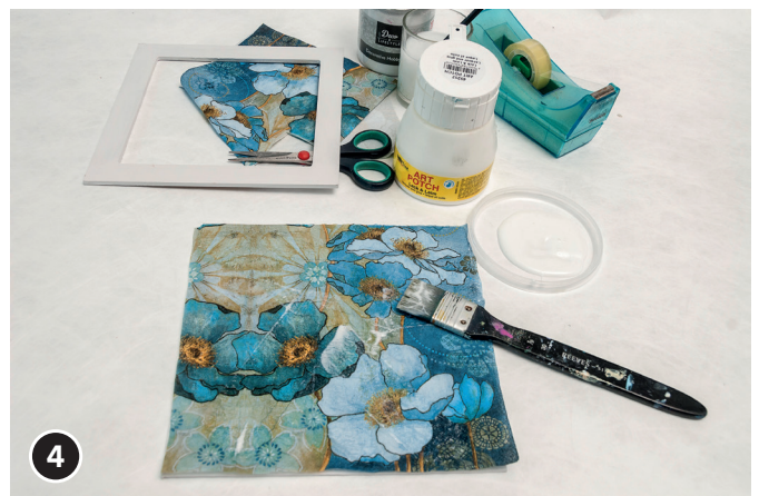
4 Place the backside of the serviette motif (uppermost layer) on the white primed panel. (The motif faces upwards). Spread deco glue onto the motif starting from the center and allow to dry.