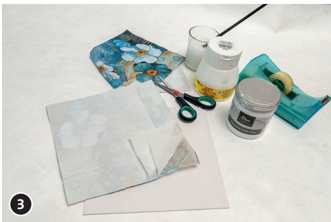
3 Separate uppermost printed layer of serviette from two lower layers.