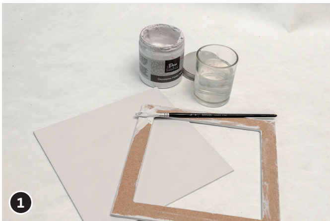
1 Paint front side of coaster back panel and frame with white paint and allow to dry. (On the white paint the serviette pattern shows best effect later. You can paint the frame in a different colour.)