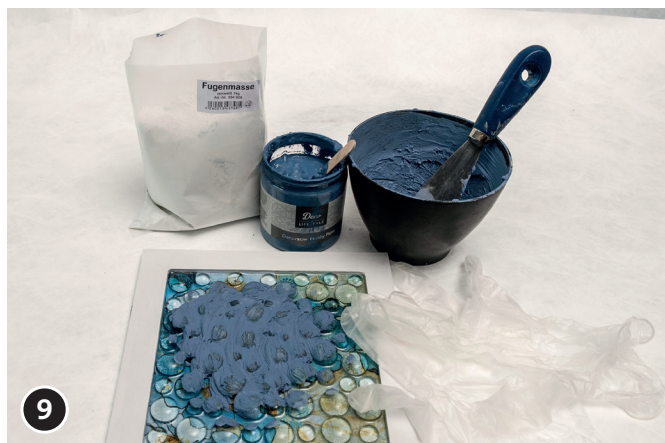
9 Grout the mosaic area with mosaic grout. This means mix grout (according to product description) with a spatula in a mixing bowl. For colouring of the grout you can add some acrylic paint. Grout whole mosaic area (use disposable gloves for spreading grout directly with your hands). After approx. 15 minutes remove excess grout with a damp sponge. Repeat this process several times. Allow to dry overnight. Finally polish the mosaic surface with a dry cloth until it shines.

Transfer instruction to the other mosaic coasters.