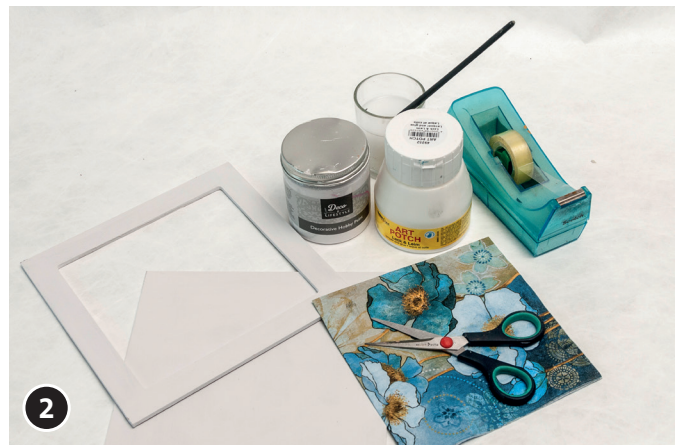
2 Cut serviette to size of the back panel.