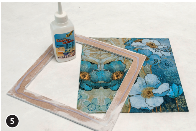
5 Attach the frame (to the front side of the back panel) using glue.