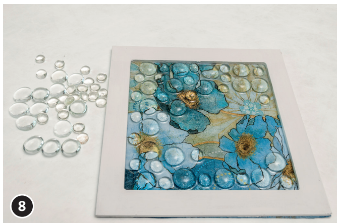
8 Place the transparent mosaic tiles immediately into the moist glaze. Allow the glaze layer to dry.