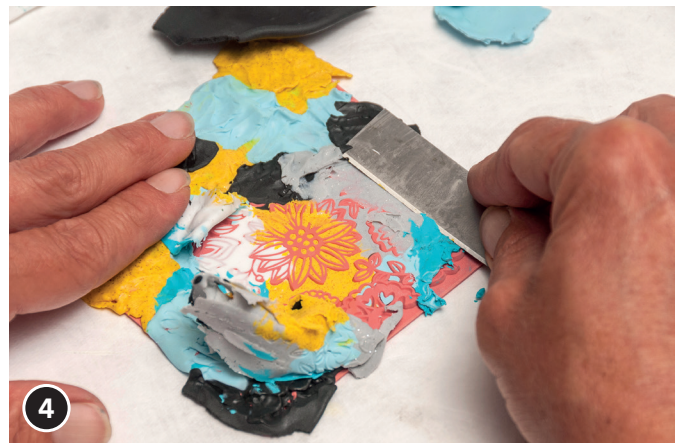
4 With the Fimo cutter remove the Fimo layer until Fimo stays only in the depressions.