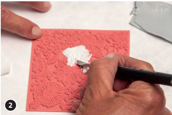
2 With the modelling tool press the modelling clay onto the texture mat.