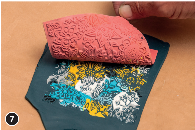
7 Carefully remove the texture mat.