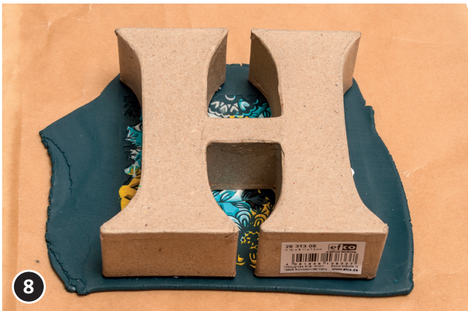
8 Place letter on the decorated modelling clay. Cut out the shape of the letter with craft knife.