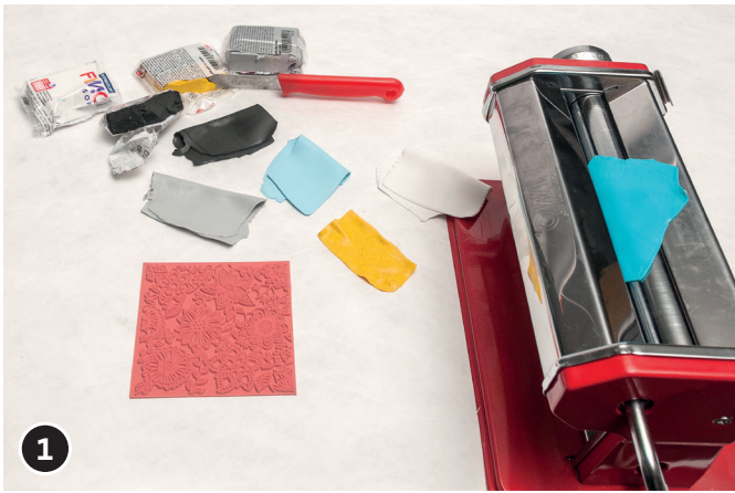
1 Knead desired modelling clay warm with hands. For each colour roll out an approx. 2 - 3 mm thick slab with the modelling roller (or clay machine).