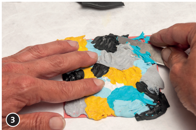
3 Apply modelling clay onto the whole texture mat. Depressions of the design should be filled up completely.