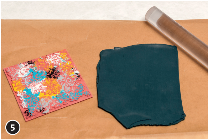
5 Roll out an approx. 2 - 3 mm thick slab from black Fimo with the modelling roller (or clay machine). The size of the slab should correspond to the size of the letter.