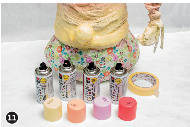
11 Spray gnome cap with paint. Allow to dry overnight.