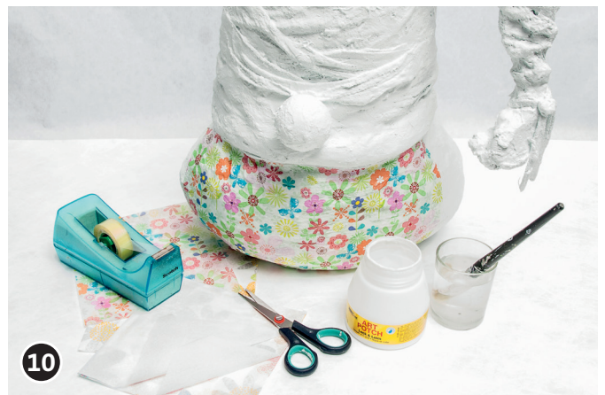
10 Separate uppermost printed layer of serviette from two lower layers. Cut serviette to desired size (according to gnome size). Place backside of uppermost layer of the serviette on the gnome body. Carefully apply deco glue on the serviette with the bristle brush starting from the center. Use a soft bristle brush. Glue serviette to the whole gnome body. Allow to dry overnight.