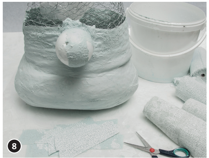
8 Fasten polystyrene ball (nose) with modelling bandages to cap edge.