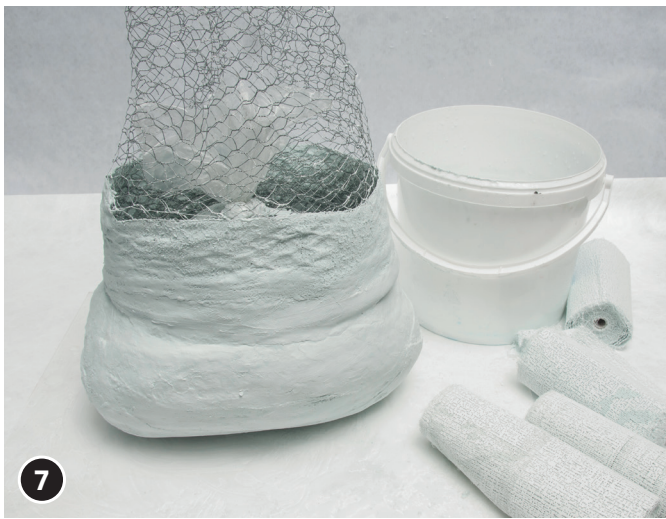
7 Fix body and cap with more modelling bandages.