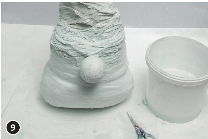
9 Wrap mesh cap completely with modelling bandages. Allow to dry for 1 - 2 days.