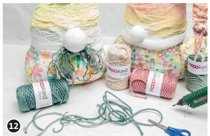
12 Use jute yarn for bow and moustache. Cut to desired length, make a knot and fix with glue gun or glue.

Have fun creating and enjoy! Your Opitec Creative Team!