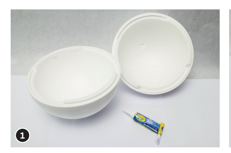
Stick the two Polystyrene ball halves together (3D-silicone).