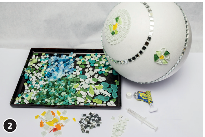
Mark the desired pattern with a pen on the ball, then start fixing the mirror mosaic (559602) with the 3D-silicone.