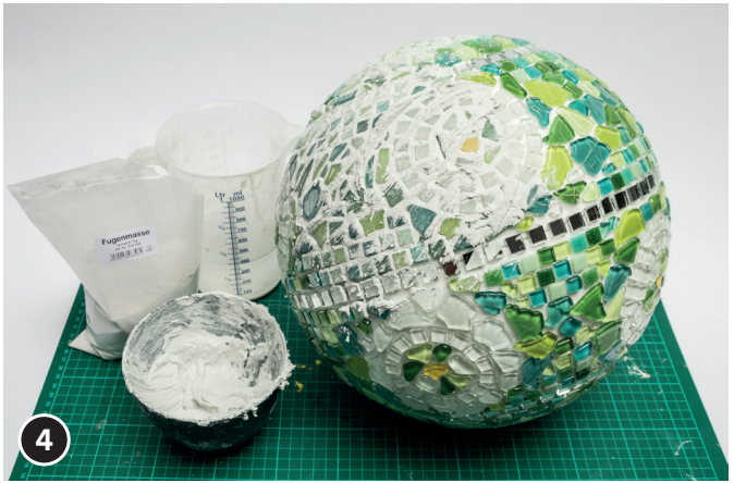
Mix the mosaic grout with water according to instructions. Put the protective gloves on and distribute the grout on the mosaic surface. After 15 minutes take the excess grout off with a sponge. Repeat this procedure several times. Let the grout dry overnight. Polish the mosaic surface with a dry cloth.