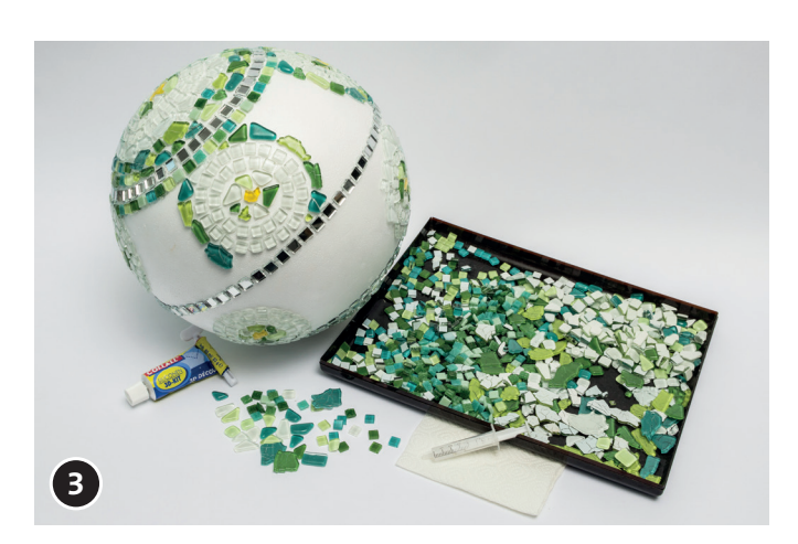
Now stick the different mosaics all over the ball. Let the silicone dry overnight.