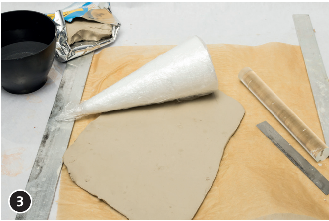
3 Wrap the matching styrofoam ball with a cling film.