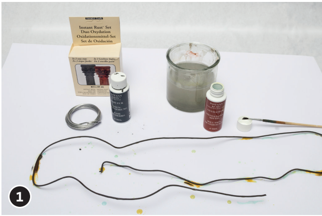
1 Apply rust effect on the product manually. Colour the aluminium wire with rust effect.