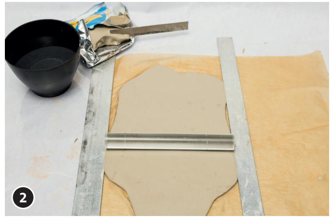
2 Roll an approximately 5 mm thick plate of soft clay.