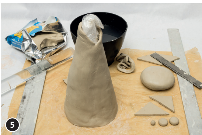
5 Modell the medallion (head), ears, eyes and nose of clay, matching to the size of the cone.