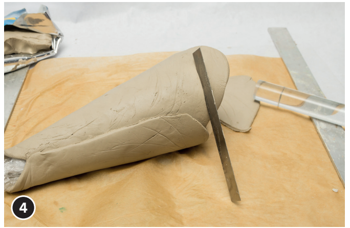
4 Put the soft clay plate around the cone and cut the clay at the bottom of the cone succinctly. Smooth the edges with water.