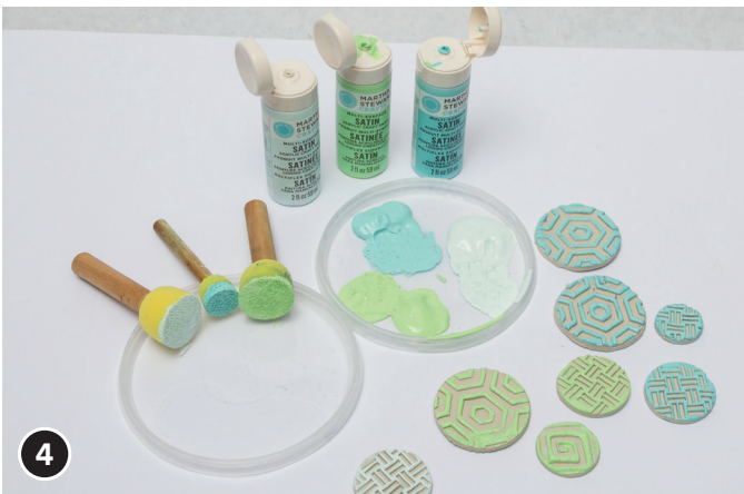
4 Paint dried motives with the template dwarfs.