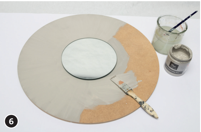
6 Prime the ronde with stone gray chalky finish color. Allow the paint to dry.