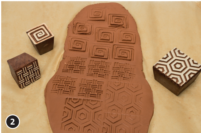
2 Emboss different patterns with the block-stamps in the soft clay.