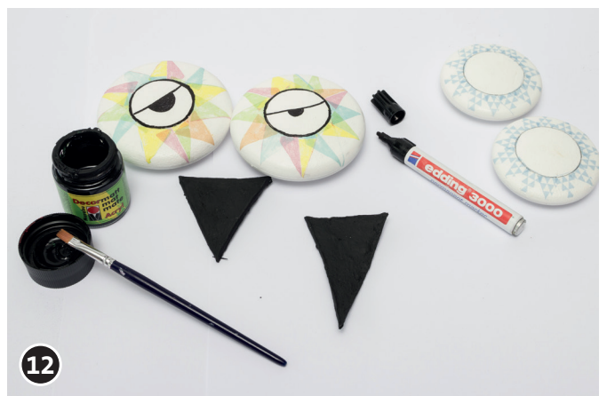
12 Paint eyes with the edding pen. Prime the beak with black paint. Allow the paint to dry.