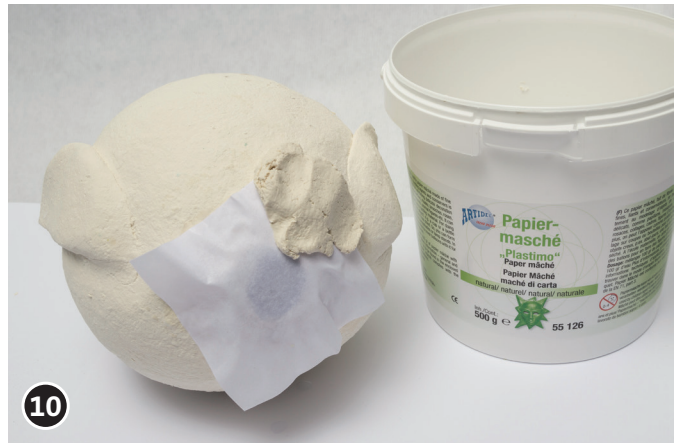
10 Close the opening with papier maché close, let papier maché dry.