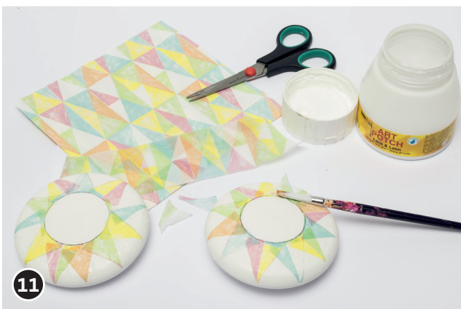
11 Cut the napkin in the desired shape. Remove the top layer of the napkin and fix it with napkin glue on the medallions. I.e.: lay the napkin with the bottom and put the glue on top of the napkin. The adhesive dries transparent.