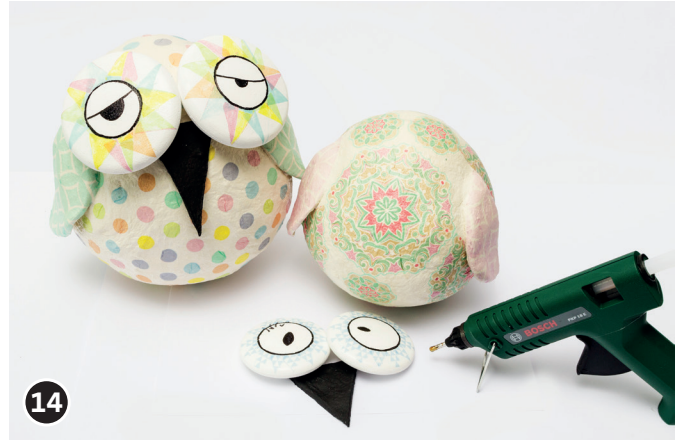
14 Fix the beak and eyes with the hot glue gun.