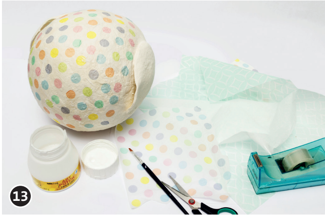
13 Stick owl body and wings with the napkins as described. Dry the adhesive layer.