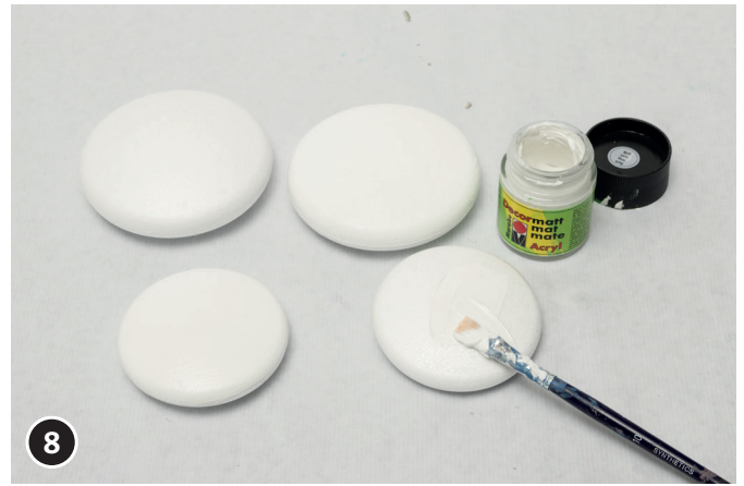
8 Prime the styrofoam medallions with white paint.