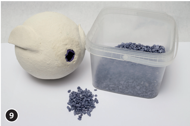
9 Fill the dried Owl body with some stones.