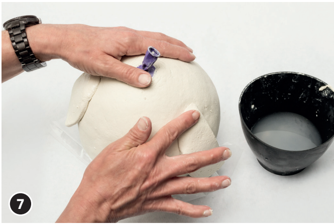
7 Press the wings with some water at the owl body. Dry the papier maché body about 3 - 4 days.