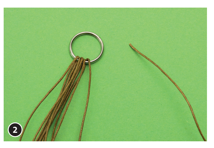
Put the bunch through a keyring. The ends of the bundle should lie on each other.