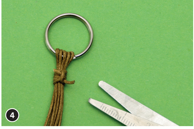
Knot it firmly and cut the ends short.