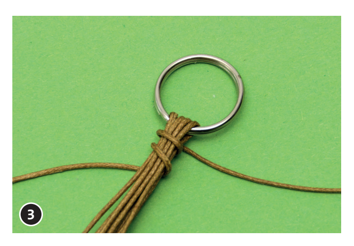
Wrap the bundle strongly with a approx. 15 cm long imitation leather cord piece beneath the keyring.