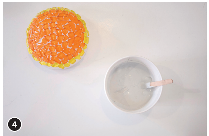
4 When the stones are dry, you can prepare the grout to fill the space between the stones (prepare the grout according to the instruction).