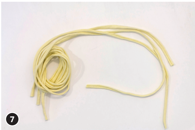
7 Cut three pieces of Zpagetti, the length of them must be equal.