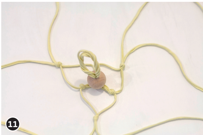
11 Now knot all the threads together.