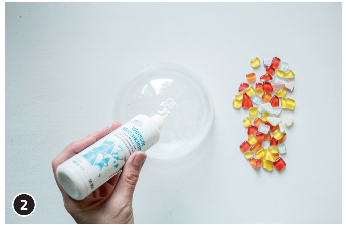
2 Start to glue mosaic stones on the upper surface of the ball.