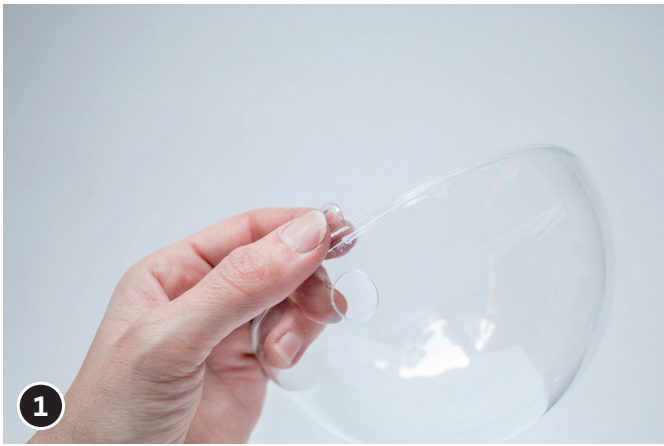
1 Divide the ball into two parts and remove carefully the hooks.