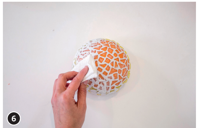
6 Remove the excess of the grout carefully with the cloth. Leave the ball to dry for 24 hours.