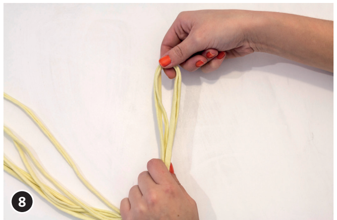
8 Put the doubled zpagetti through the holes in the wooden balls.