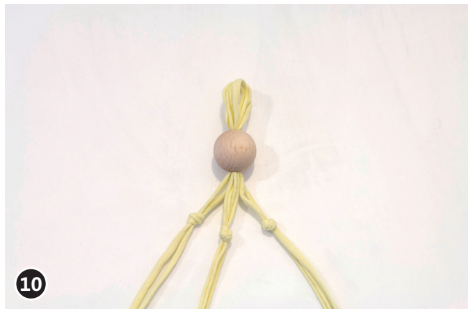
10 Knot the rest in the same way.