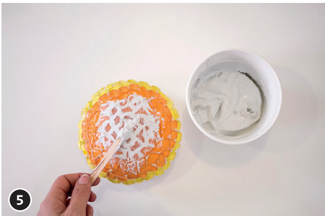
5 Spread the grout on the mosaic.