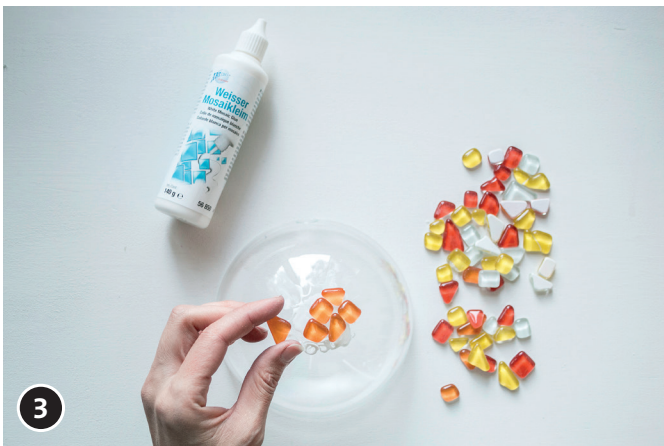
3 Glue it from top to the bottom. This way the mosaic will not slip down. The option is to use the silicone glue.