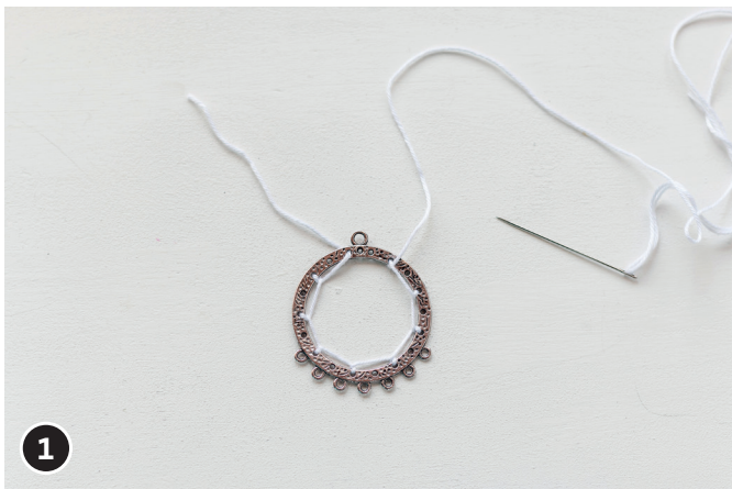
1 First of all, thread the white yarn in the eyes of the metal pendants