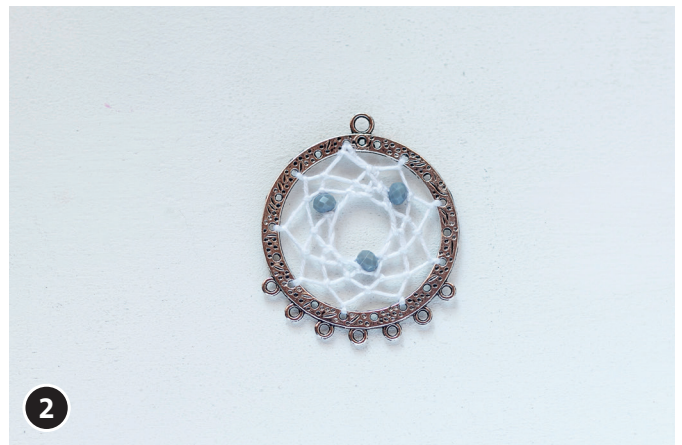
2 Step by step weave the dreamcatcher in the interior of the metal pendant, thread beads.