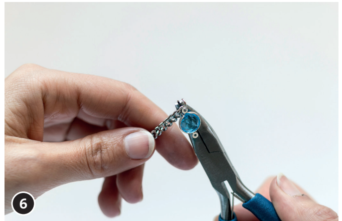
6 Now hang the blue beads on the chains using small metal rings.