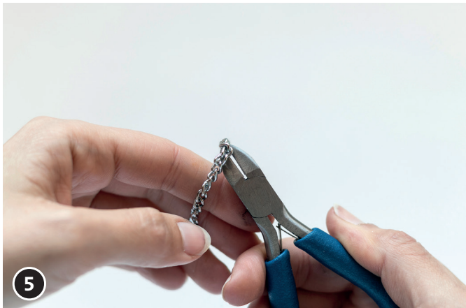
5 Cut the chain into parts. Shorten parts to the desired length.