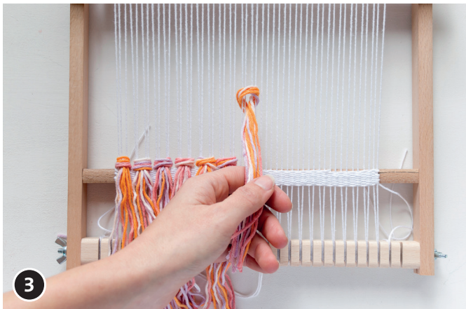
3 Start weaving the cotton yarns to create fringed look