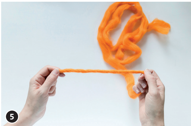
5 Now you must prepare sheep wool.