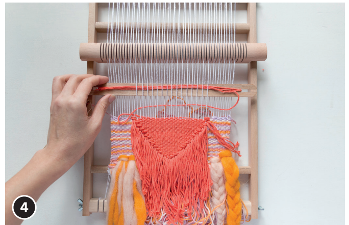
4 In the next step, you add your personal features. You can combine various colours and geometrical shapes together.