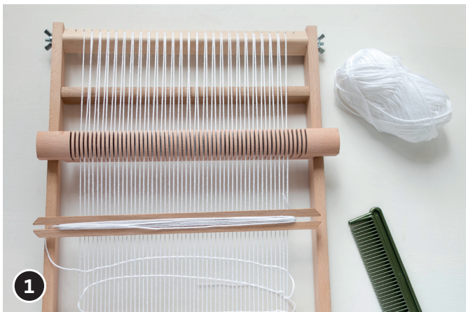
1 Prepare the frame according to the enclosed instruction and pull cotton yarn several times.