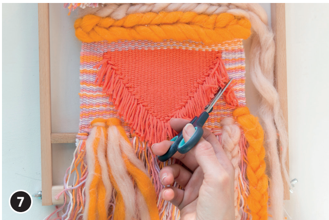
Cut the ends of the yarn to make it triangle.