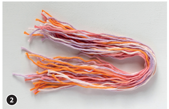
2 Cut the colourful cotton wool yarn so the parts have the same length.