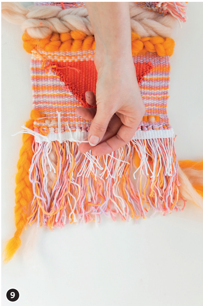
Knot the bottom ends of the decoration to make it stable.