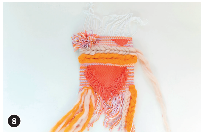
Take the woven design out of the frame.