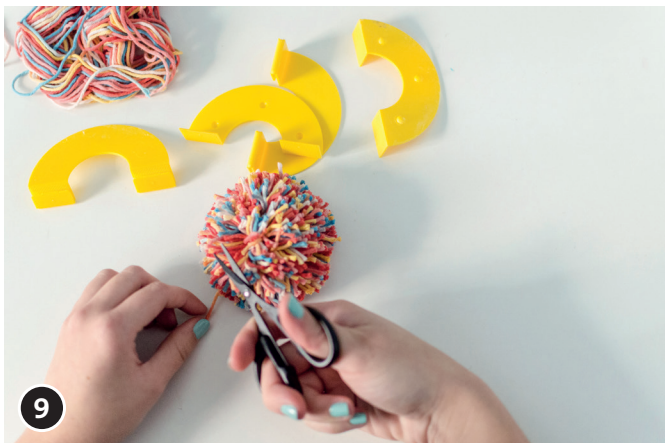
9 Make as many pom-poms as you wish in the same way.