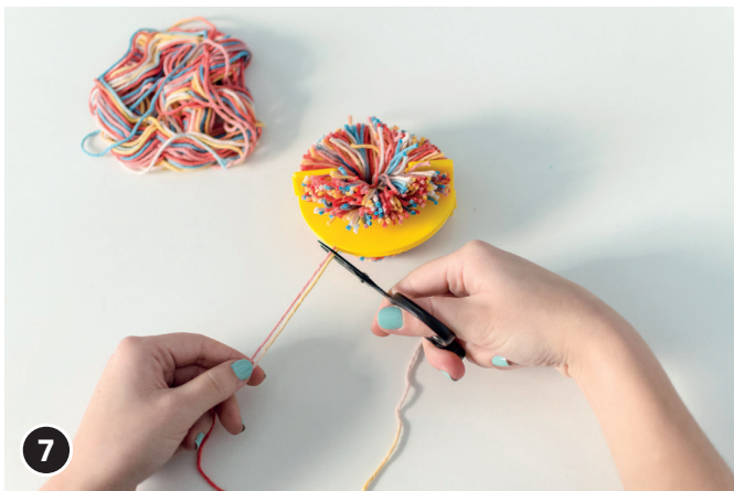
7 Cut the ends of the yarn.