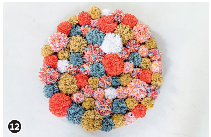
12 Now your colourful wall decoration is finished.

OPITEC Creative team wishes you lots of fun!