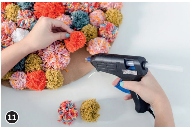
11 When you decide what your decoration should look like, you can finally glue the pom-poms to the disc.