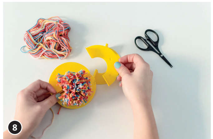
8 Now you can remove the pom-pom form. You can trim the pom-pom so it look nicer. Your first pom-pom is finished.