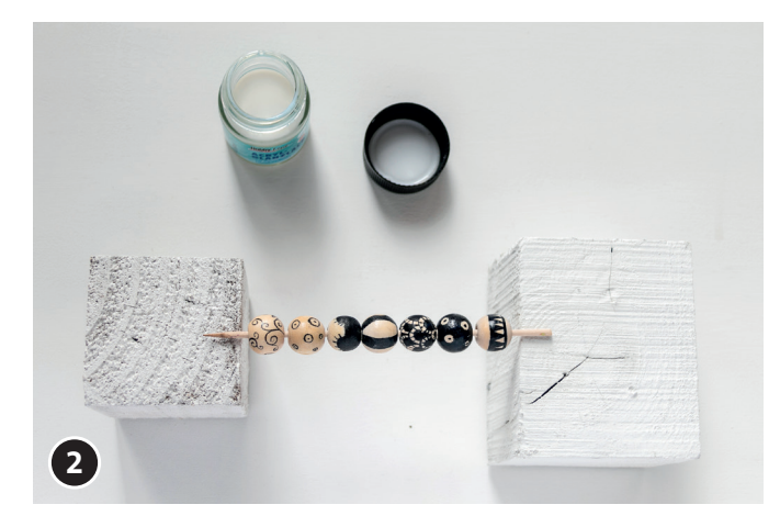
Paint them with two layers of varnish, leave them to dry completely.