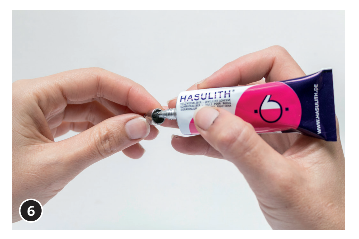
Fill the endcaps with the textile glue.