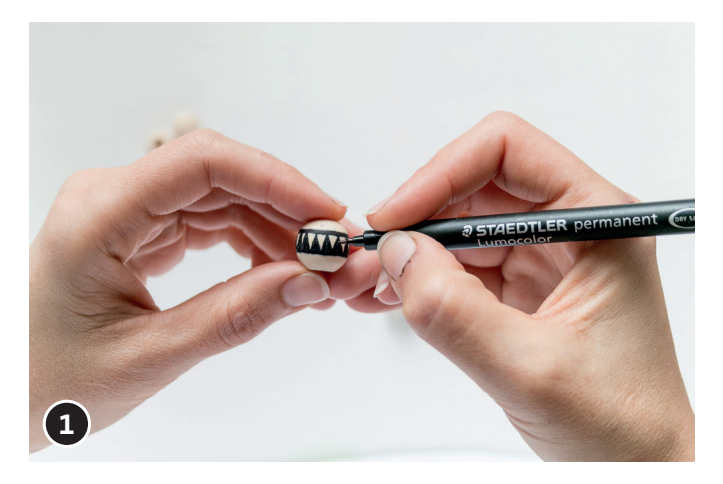
Draw your favourite pattern on the wooden beads using permanent marker.