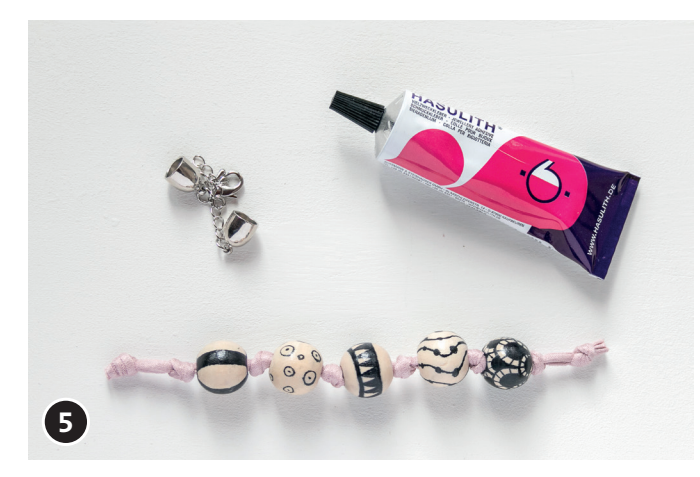
Shorten the ends and knot them.