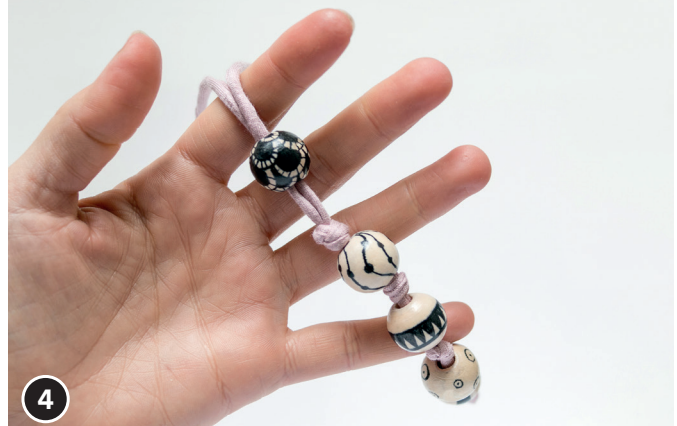
Now thread the wooden balls on the Zpagetti cord making the knot between the balls.