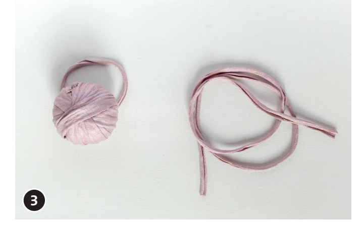
Cut the Zpagetti cord to have required length.